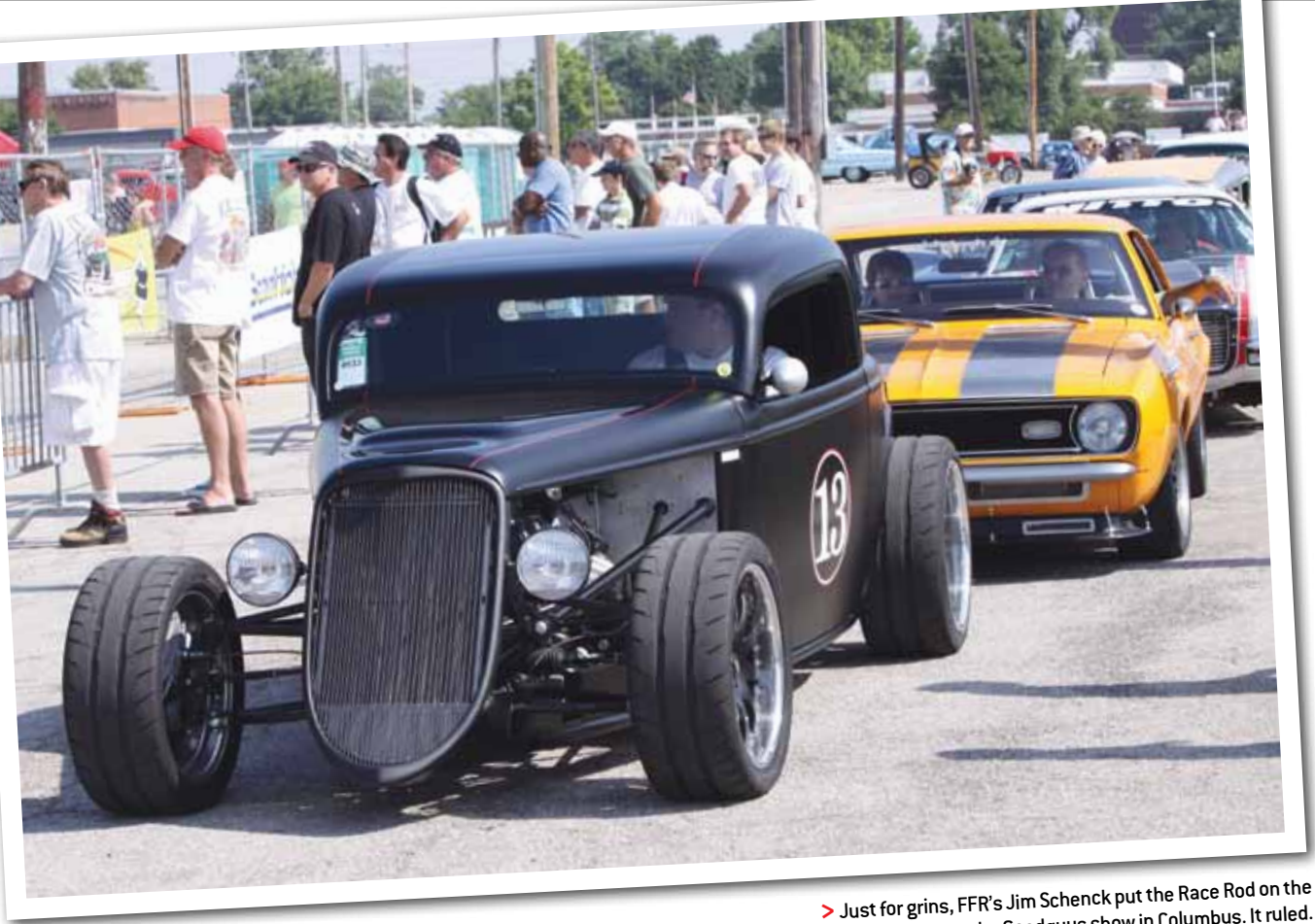
autocross at the Goodguys show in Columbus. It ruled.

handiwork. The alignment was set at 7 degrees of caster, 1.25 degrees negative camber, and 1/16inch toe-in. On the corner scales and with a full load of fluids (but without a driver), it showed a curb weight of 2,320 pounds and a freakish balance of 50.1 percent front, 49.9 percent rear.