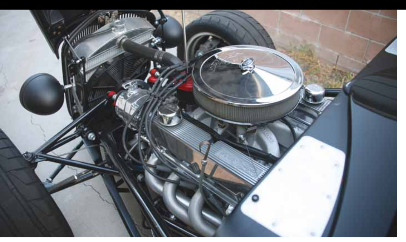
> The Ford Racing 347 makes great torque, especially for a light car, and barks like a pack of rabid dogs. With no choke on the Holley, it's a little cold-blooded but livable. The red things between the engine and the fan are the tops of the Koni coilovers.